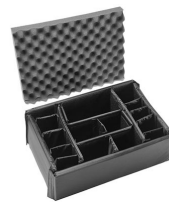
iM2450-DIV Padded Divider Set