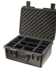
iM2450-X0002 With Padded Dividers