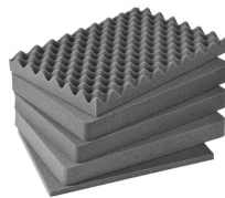
iM2450-FOAM 5 pc. Replacement Foam Set