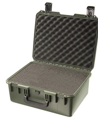
iM2450-X0001 With Foam