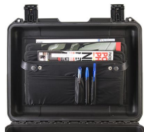
iM24XX-LIDORG Lid Organizer