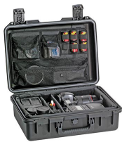
iM24XX-PHOTOPALLET Photography Pallet