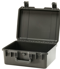
iM2450-X0000 No Foam