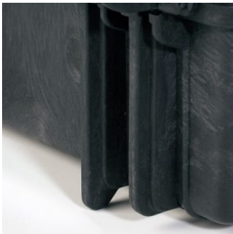
COUNTERBALANCE SUPPORTS (in certain models)