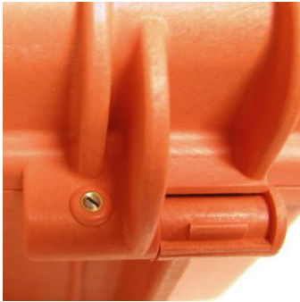
LID CAN BE SET TO SLIDE-OFF By releasing the back screw, lid becomes set to slide-off when opened at 70°